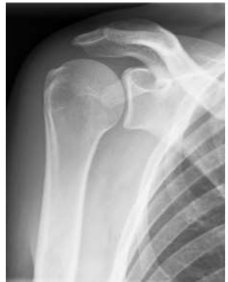
X-ray of a shoulder

of our patients' examinations. As a new machine, it will produce high quality images using the latest technology, thereby enabling more accurate diagnosis. We hope the machine will be in use by the end of 2018.