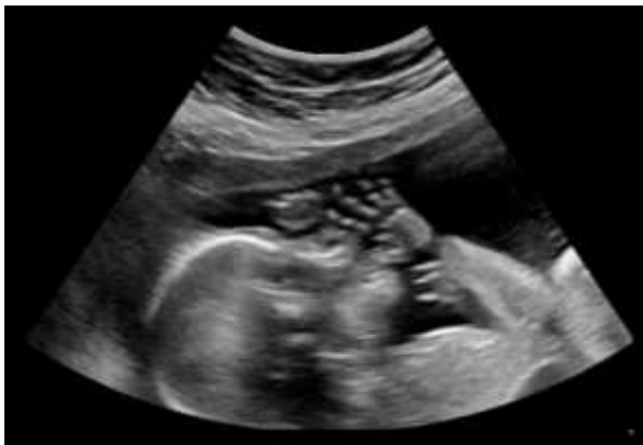
The layman struggles to make sense of some ultrasound images, but not this one