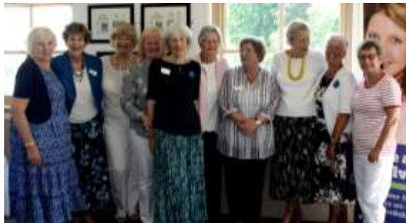
A group of our volunteers at afternoon tea in the Crown Hotel, Blandford, organised by Dorset HealthCare to say thank you to volunteers from across the whole county.