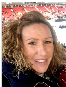
at Victoria Hospital, Wimborne and